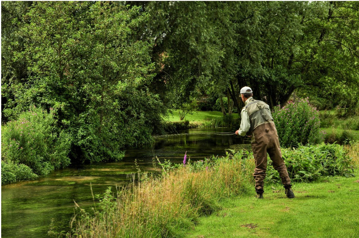
A few yards up from start of the beat

Downstream of the wooden footbridge: Cross the footbridge to the opposite bank; the end of the beat is a concrete bridge with a steel handrail which is about 150 yards downstream. The best way to reach the start is on foot; cross the wooden footbridge in the garden, turn right downstream until you reach the concrete bridge.