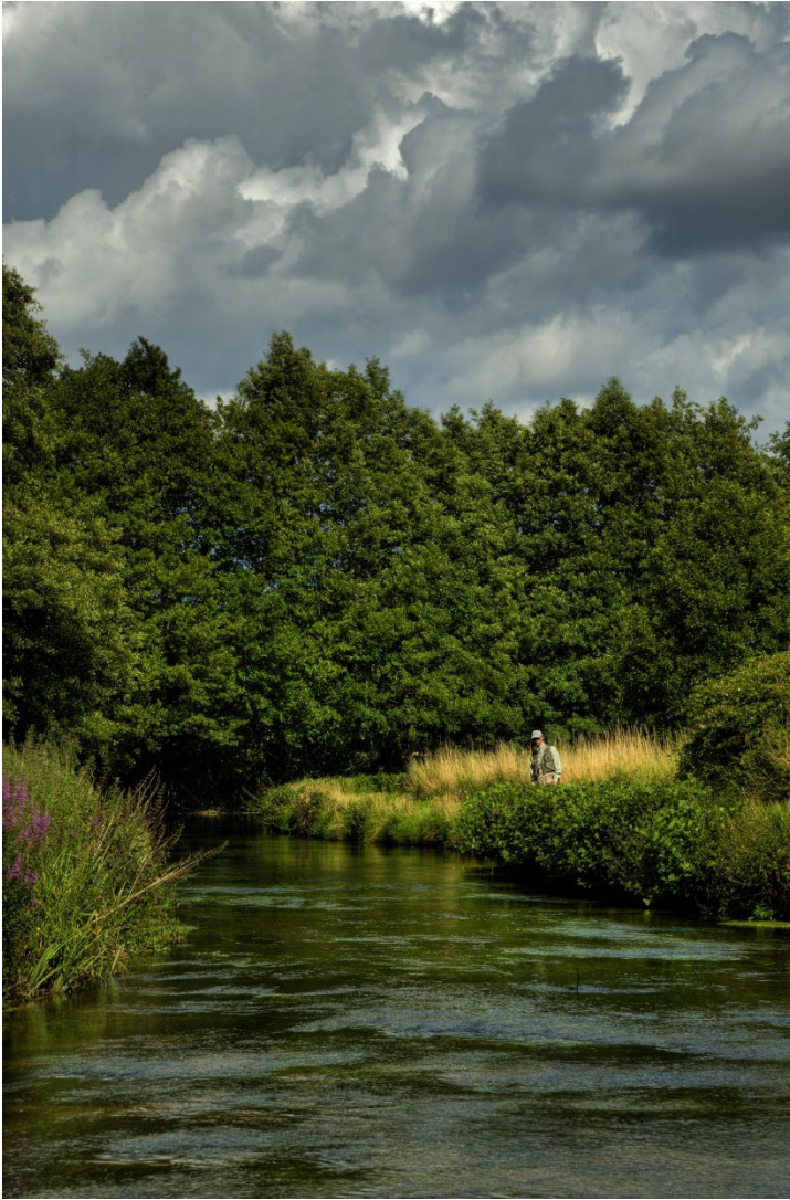
Looking down to Ricketty Bench pool

Above Ricketty Bench pool is a wide, straight section which is mostly shallow. With a high bank this is one of the easier places to spot fish, though your view will be obstructed by the alder bushes that line your bank. It is under here that the bigger fish hide. Depending on the time of day, the smaller fish move onto the gravel shallows to feed, but you will rarely see the big fish outside the deeper sections. Even then you often have to wait 10-15 minutes for them to show themselves.