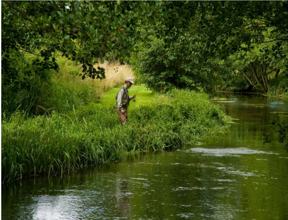
Looking upstream to Rickety Bench pool

To this point when there is no surface action lightly weighted nymphs will prove very effective. It is worth remembering that some of the bends are very deep, as much as 4-6ft so try a long tippet and let the nymph go deep and knock along the tree roots. Unfortunately, you will get snagged from time-to-time, but the rewards can be worth the risk.